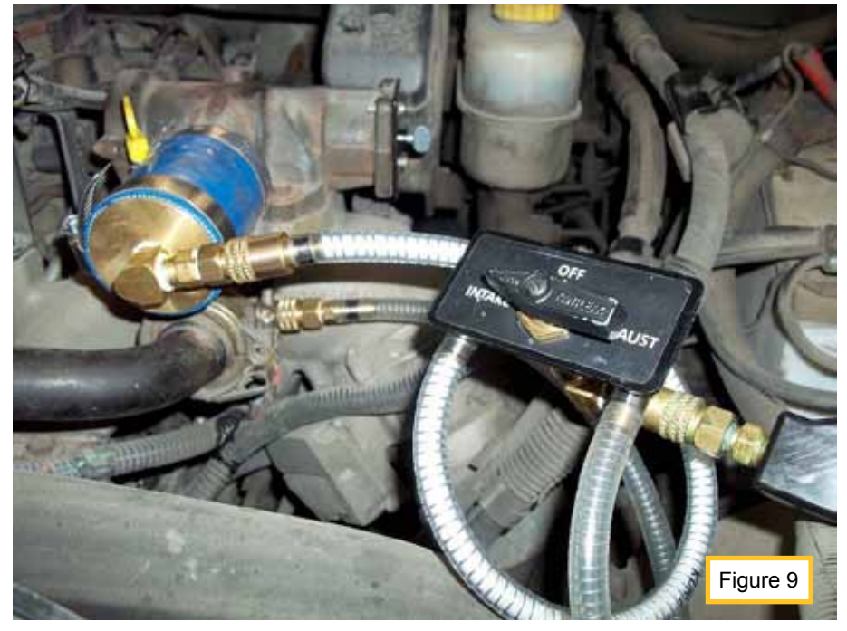
Note: Let the vehicle operate for an additional 5 minutes and rev the engine several times to clear all residual fluid.

Note: At any time during the intake service you hear a diesel knock sound, turn manifold valve to off for 2 minutes. After two minutes then turn manifold valve to intake and continue service.